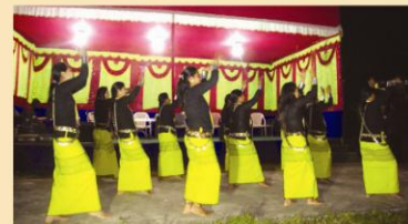
Folk dance by artists from Arunachal