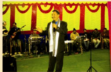
'Bistirma Parore....' by the Organizing Secretary