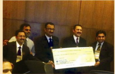
Handing over the hefty surplus to ACS(I) in GBM held at New Delhi