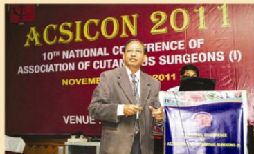
Driving home a surgical pearl