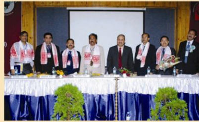
The dignitaries on the dias