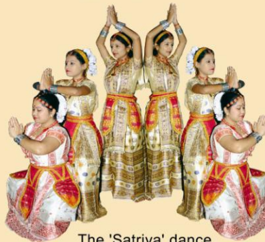
The 'Satriya' dance