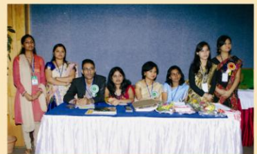
The emcees, coordinators & volunteers