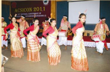
The ubiquitous 'Bihu' performance