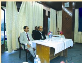
Doyens at the meet