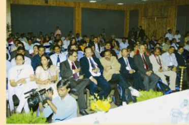
The faculty & delegates seated for the Inauguration