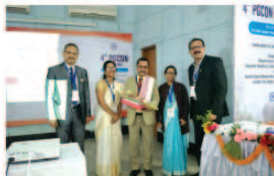
A moment from PGCON (east zone) at GMCH