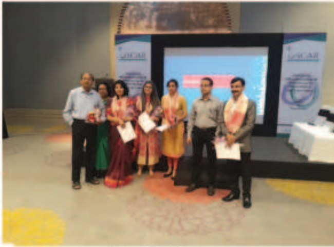
The O-SCAR meet