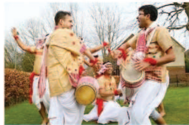
Traditional Maho ho Dance

(Meaning : This family is very rich. God bless the family and the family will prosper and they will donate us plenty.)